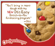
300 x 250 banner

Located on every interior page of our website